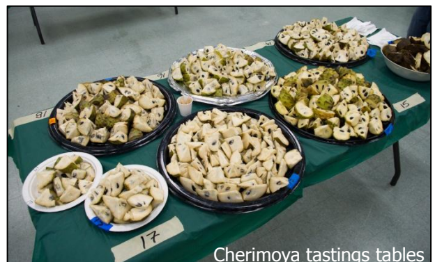
Cherimoya tastings tables