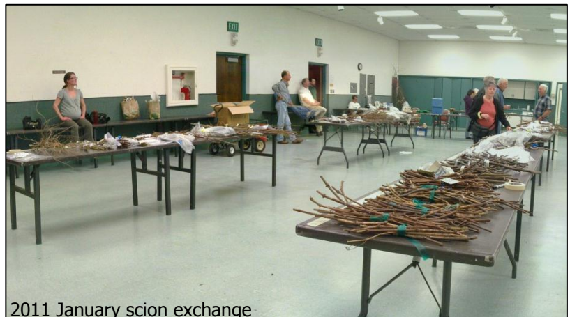
2011 January scion exchange