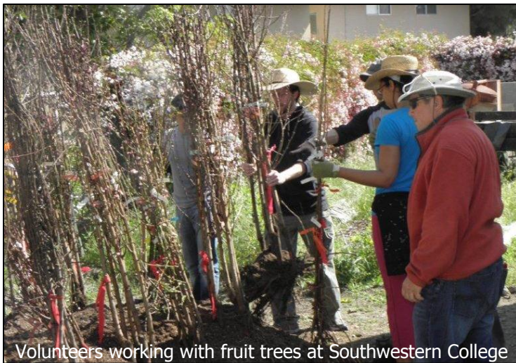
Volunteers working with fruit trees at Southwestern College